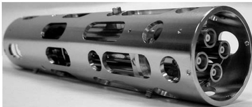
Figure 1: 9.5 mm Quadrupole Mass Filter with Vented Housing shown without Entrance and Exit Lenses

The information in Table 1 and Table 2 should be used as a guide for choosing the mass filter for your application.