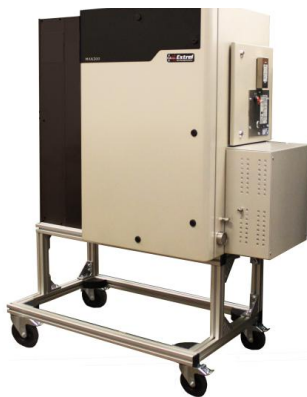
Figure 1. The MAX300-RTG® Industrial Process Gas Analyzer.

An online mass spectrometer allows operations to cut costs, increase production, and maintain a safe working environment by monitoring multiple stages of RNG production. Live readings of the raw gas composition enable real-time process adjustments to maximize up-time and on-spec product gas yields. In addition, the analyzer can also be used to monitor odorization and provide automated updates of the BTU content of waste (tail) gas sent to the flare or thermal oxidizer. The mass spectrometer typically reports live updates of methane, carbon dioxide, air, non-methane organic compounds, siloxanes, and sulfur for increasing process efficiency, and for identifying leaks in the upstream off-gas supply lines.