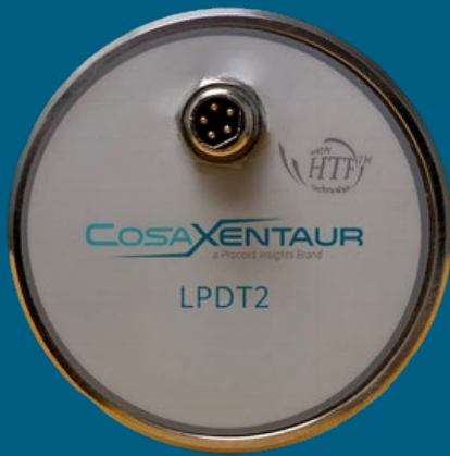
No display version