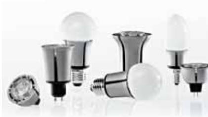
Figure 2. LED lamps are now available in a range of common fittings as low-energy retro-fit alternatives to traditional incandescent lamps

Early LED lamps were not dimmable but recent products can now be dimmed