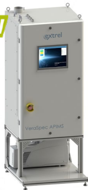
Atmospheric Pressure Mass Spectrometers for Real-Time, ppt-Level, Multi-Impurity Analysis VeraSpec™ APIMS