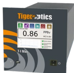
CRDS Analyzers for Monitoring ppt-Level HCl, NH 3 and HF in Clean Room Air T-I Max HCl™ and T-I Max NH3™ and T-I Max HF™