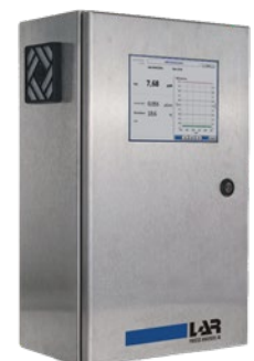
Water Analyzers for Ultra-Pure Water Applications QuickTOCtrace™