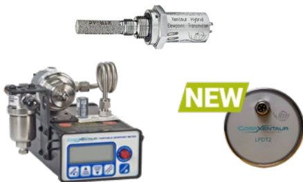
Aluminum Oxide Dew Point Meters for Portable/Fixed/Loop-Powered Applications XDT / XPDM / LPDT / LPDT2™