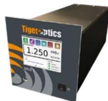
ppt-Level CRDS Trace Moisture Analyzer HALO KA H2O™