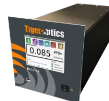
CRDS for Corrosive, Rare, and Fluorinated Gases HALO 3™