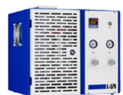
COD Water Analyzer for Laboratories QuickTOClab™