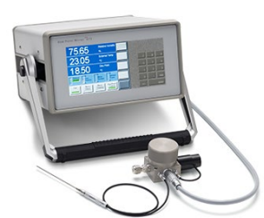
Chilled Mirror Dew Point Meter and Humidity Generators Model 473™