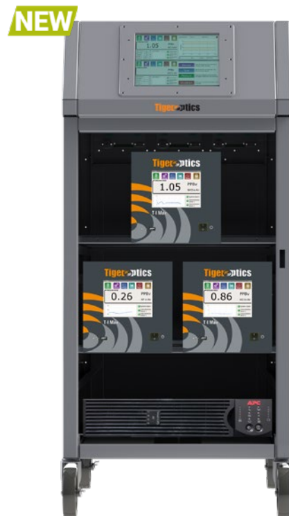
Mobile Solution for Monitoring AMC GO-Cart™