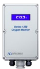
Trace to Percent Oxygen Monitors for Portable and Fixed Applications Series 1300™ and OXY-SEN™