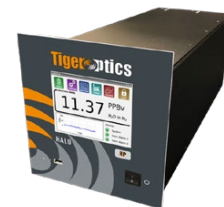
CRDS Reduced-Pressure, Trace-Level Analyzer HALO RP™