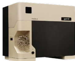
Mass Spectrometer for Real-Time, ppb-Level Analysis MAX300-LG™