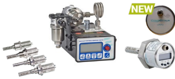
Aluminum Oxide Dew Point Meters & Transmitters with Hyper-Thin-Film Technology for Portable/Fixed/Loop-Powered Applications XDT | XPDM | LPDT | LPDT2™