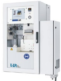
Water Analyzers for Pure and Process Water Applications QuickTOCpurity™