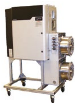
Ambient Air Mass Spectrometer for Environmental Applications MAX300-AIR™