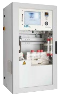
TOC Water Analyzer for Harsh Wastewater Applications QuickTOCultra™