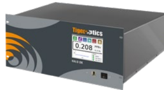
CRDS Trace Gas Analyzer for O 2 HALO OK™