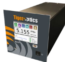
CRDS Trace-Level, Low-Pressure Moisture Analyzer HALO QRP™