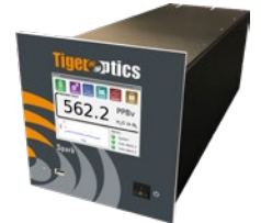
CRDS for Pre-Purifier Measurement H 2 O, CH 4 , CO, CO 2 , C 2 H 2 Spark™