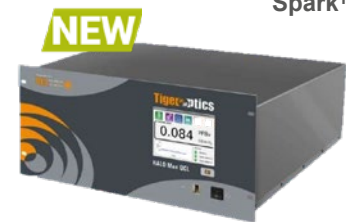
ppt-Level CRDS for CO and CO 2 , HALO Max QCL™