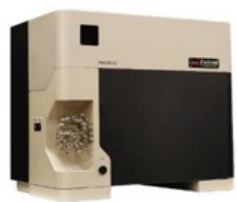
Benchtop Mass Spectrometers for Real-Time, ppb-level, Multi-Impurity Analysis MAX300-LG™