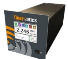
CRDS for ppt-Level H 2 O in pure NH 3 ALOHA+ H2O™