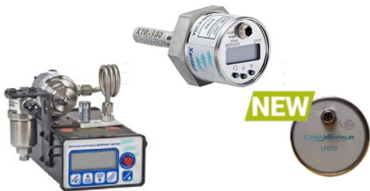
Aluminum Oxide Dew Point Meters for Portable/Fixed/Loop-Powered Applications XDT / XPDM / LPDT / LPDT2™