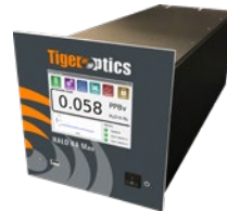
CRDS For ppt-Level H 2 O, CH 4 and NH 3 HALO KA Max™