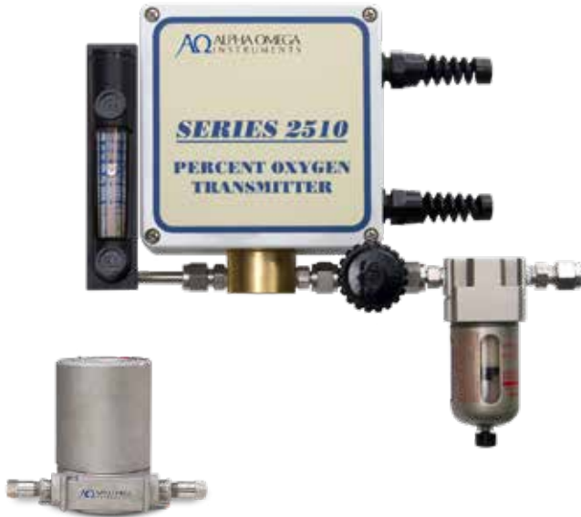
Optional NEMA 7 Enclosure.

The Series 2500 and 2510™ Percent Oxygen Transmitters are blind transmitters designed to provide exceptional performance, accuracy, and stability. Percent oxygen measurement ranges are available from 0-2% to 0-100%. A 4-20 mADC analog output is provided. The Series 2500 Trace Oxygen Transmitter is a true loop powered (14-32 VDC) transmitter. The Series 2510 Percent Oxygen Transmitter is available in either AC powered (115 or 230VAC, 50-60Hz) or 24VDC. Optional sample path configurations are available.