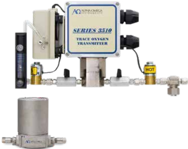
Optional NEMA 7 Enclosure.

The Series 3500 and 3510™ Trace Oxygen Transmitters are blind transmitters designed to provide exceptional performance, accuracy, and stability. Measurement ranges available are from 0-10 PPM to 0-20,000 PPM. A 4-20 mADC output is provided. The Series 3500 Trace Oxygen Transmitter is a true loop powered (14-32 VDC) and the Series 3510 Trace Oxygen Transmitter is available in either AC powered (115 or 230VAC, 50-60Hz) or 24VDC. Optional sample path configurations are available.